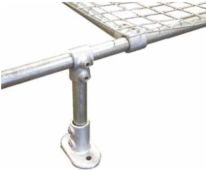
RAISED COVER LEG ASSEMBLY