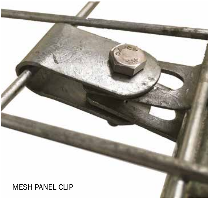
MESH PANEL CLIP