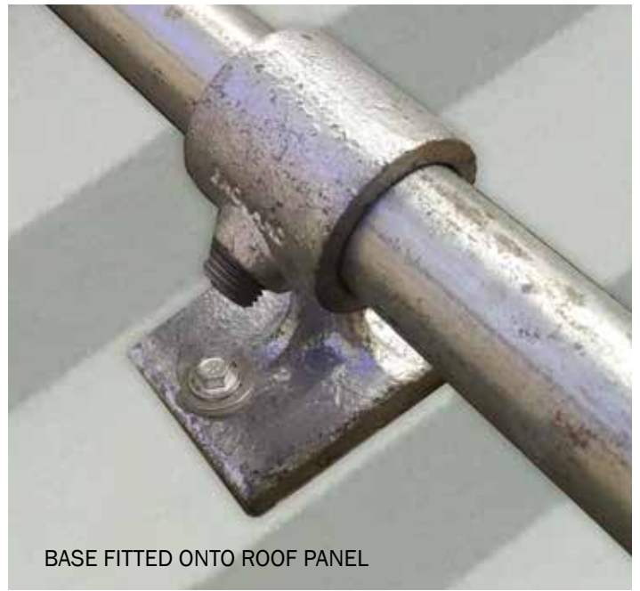
BASE FITTED ONTO ROOF PANEL